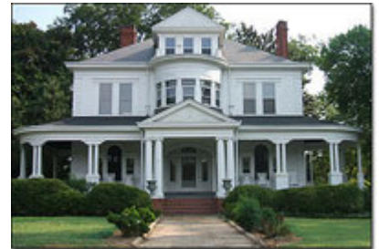
The Historic Anderson Mansion provides a pleasant working environment.

In addition to lowering overhead expenses, we believe our service allows Arbitrators to focus on the evidence rather than housekeeping. We allow Arbitrators to enjoy some of the benefits of joining an ADR firm without committing to its ongoing expenses.